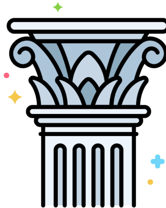
Social Economic research